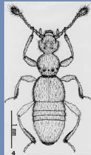
Magazine Mountain Mold Beetle