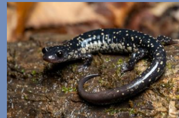
Kiamichi Slimy Salamander