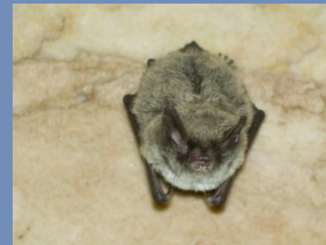
Northern Long-eared Bat