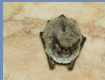
Northern Long-eared Bat

All management recommendations assume that operators and land managers are following all applicable BMPs, laws, and regulations.