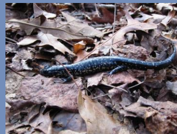
Sequoiah Slimy Salamander